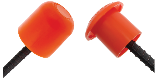
REBAR SAFETY CAPS

Used for abrasion and scratch protection only.